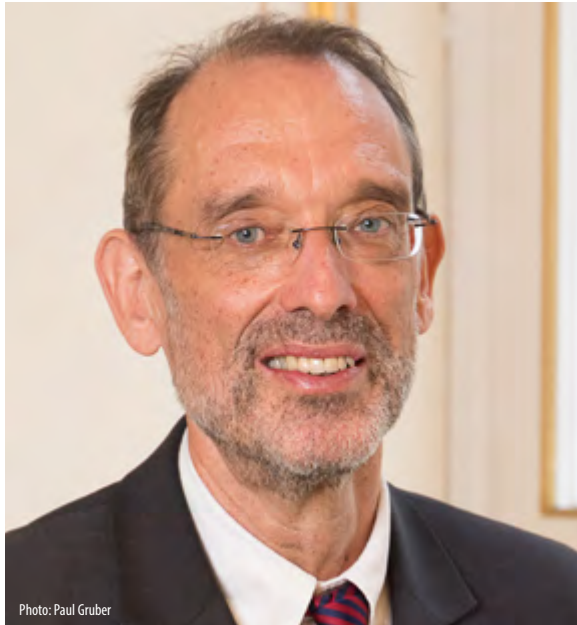
Federal Minister of Education, Science and Research Univ.-Prof. Dr. Heinz Faßmann